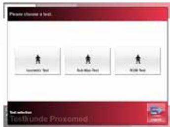
Integrated various testing