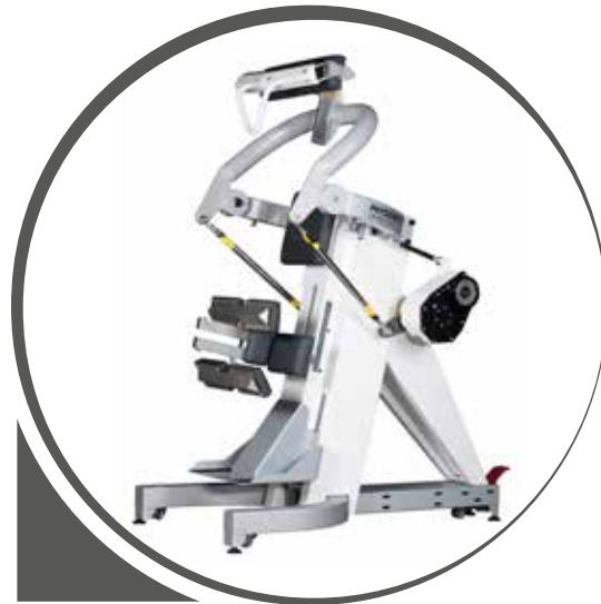
CON-TREX TP 500