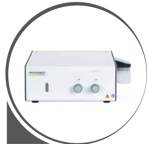
PHYSIOVAC-Expert (3rd edition)