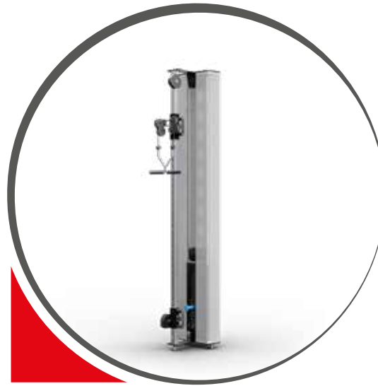
compass MTT S1 MED explosive