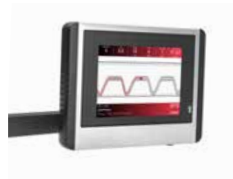
Various curves for feedback-training