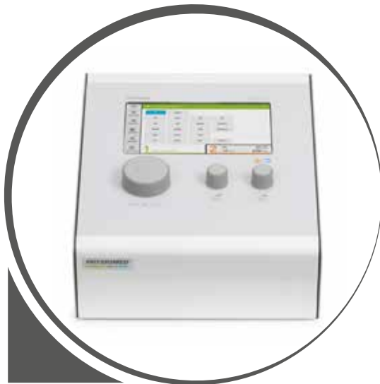
PHYSIODYN-Expert (3rd edition)