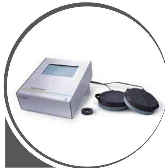
MAG-Expert with set of applicators