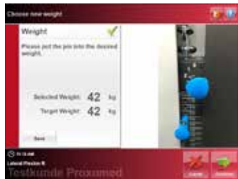
Weight detection with Ultrasonic sensor