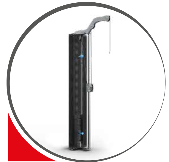
compass MTT S3 MED vertical