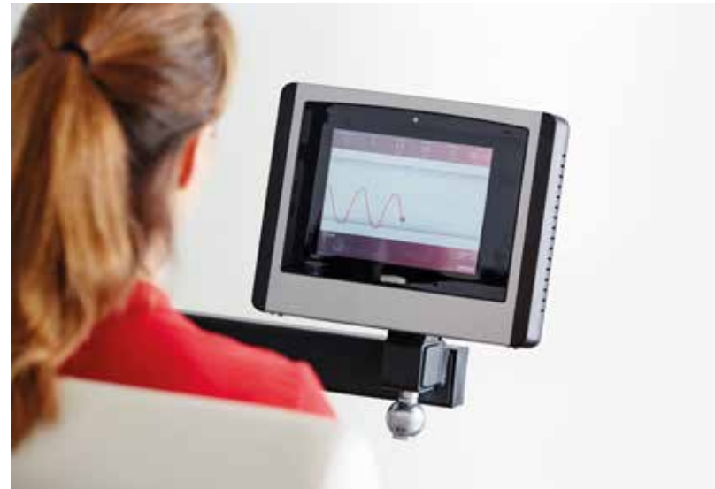
Various curves for feedback-training