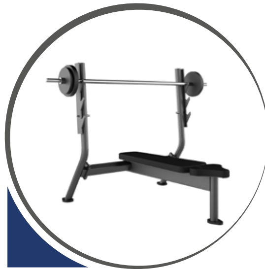
Olympic Flat Bench