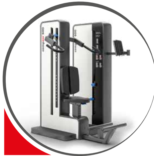
Shoulder Press/Vertical Rowing