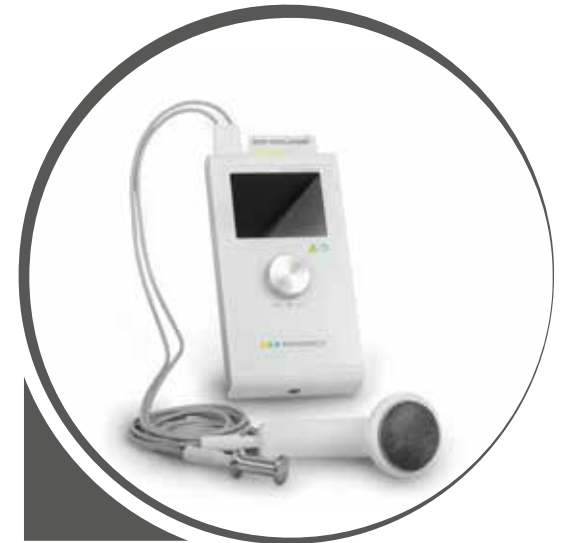
DEEP OSCILLATION Personal Home