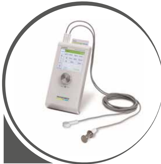
DEEP OSCILLATION Personal Basic