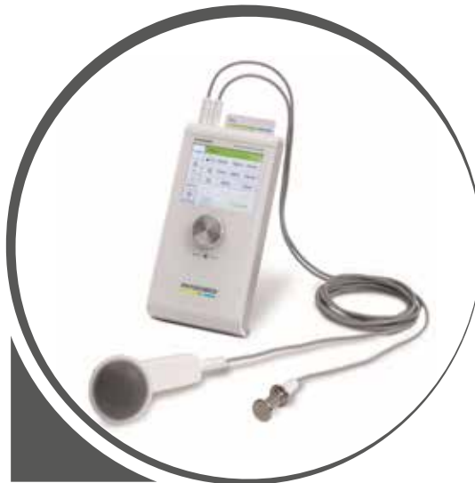
DEEP OSCILLATION Personal Pro