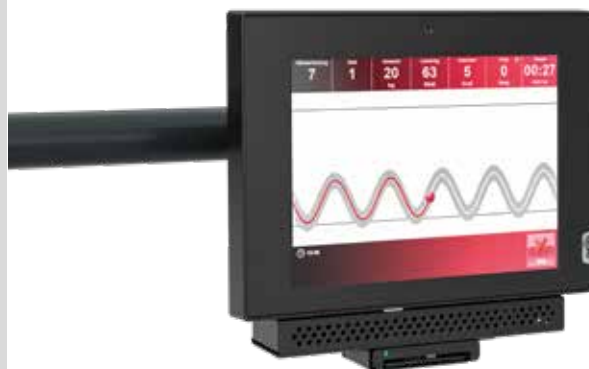
Optionally: smart assist