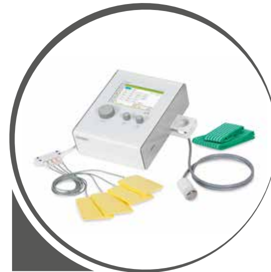
IONOSON-Expert (3rd edition)

The ergonomic ultrasound transducers offer maximum safety and reliability in terms of power output. They combine 1 and 3 MHz ultrasound in an extremely durable and biocompatible titanium transducer, thereby excluding metallurgical deposits and are also suitable for subaqueous treatment.