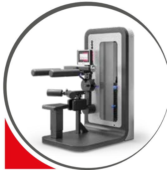
tergumed 600 Lateral Flexion