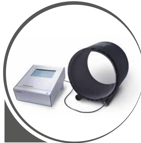
MAG-Expert with coil (Ø 30 cm)

MFC technology focuses the magnetic fields almost entirely on the inside of the cylinder. This avoids unnecessary exposure of the treatment team.