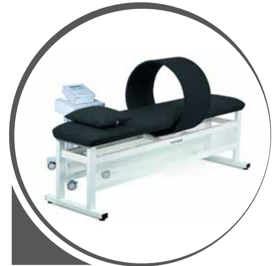
MAG-Expert with coil (Ø 60 cm)