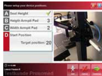
Positioning with position sensor