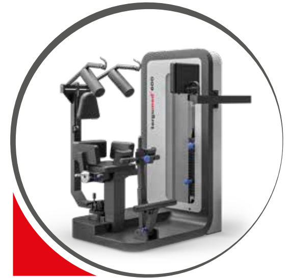
tergumed 600 Trunk Rotation