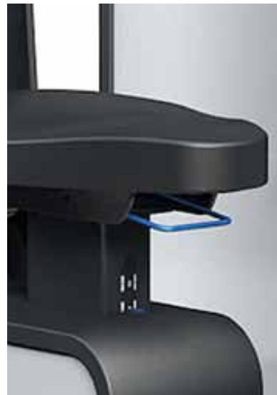
Stepless adjustment of the seat depth via pneumatic spring