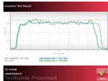
Isometric strength testing with curve