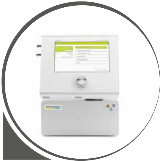
DEEP OSCILLATION Evident AESTHETICS